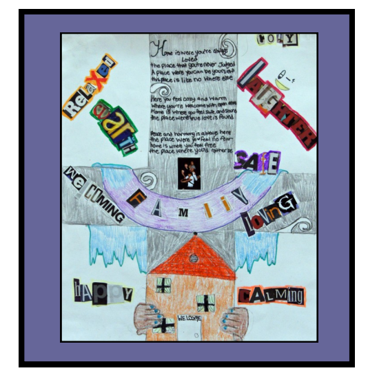
Home is where you're always loved. The place where you're never judged.

A place where you can be yourself. This place is like nowhere else.